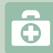
Medical & Healthcare